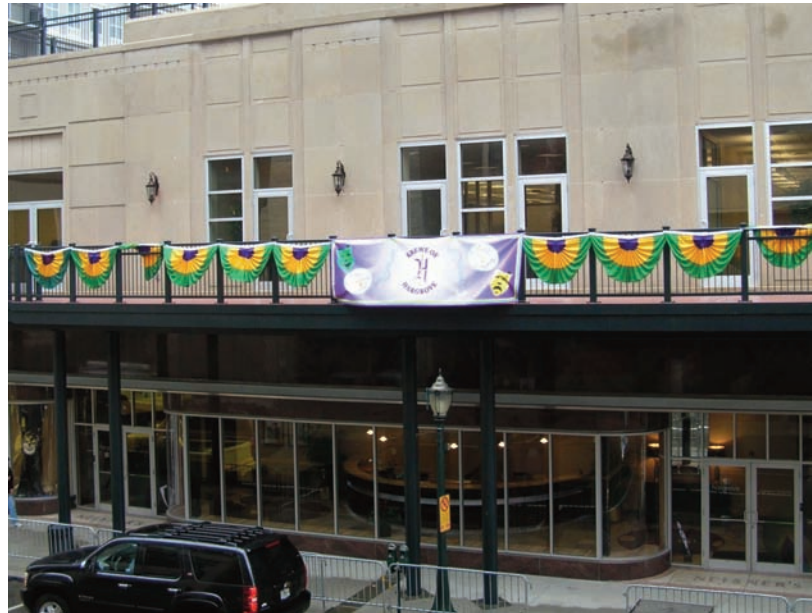
Hargrove and Associates, with a workforce of over 200, has renovated the Neisner Building and is working to bring life to the long shuttered Kress Building.