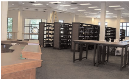
New shelves and a new desk are just part of the additions to the second floor Non-Fiction area.

According to Briskman, one of the most amazing things to experience during this process has been to work with the Library staff. "The staff has been incredible," bragged Briskman. "They have given money to the capital campaign and been good stewards of the property. They have physically moved the Library's books four times. They packed and moved everything from the Main Library to Expo Hall before construction began. When Expo Hall was damaged during the Hurricane, they packed everything and moved it to Mini Main. They then