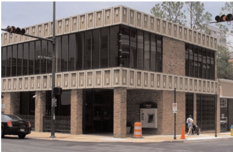
Whitney Bank has expanded its Royal Street offices and enhanced its International Banking Department to accommodate the growth in downtown Mobile.

“Our Royal Street Office is a vital location for the Mobile downtown area and for Whitney Bank. With the revitalization of downtown gaining momentum, and the new Battle House RSA Tower opening directly across the street, we see our office as being a convenient and viable place for our business and consumer customers to do their banking business,” explained Baker. “We have a full-service office with Night Depository and ATM for 24 hour availability. Our recent addition of a dedicated