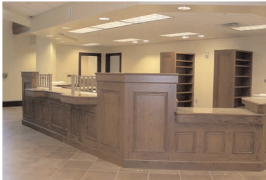
The new circulation desk is conveniently located in the spacious addition near the new entrance.

The changes to the Library are amazing and well thought-out. On the first floor, visitors and users will find a new Café and Coffee Bar run by Sean McLaughlin of Creative Catering. The Children's Library has expanded and includes a new Storytime Room, lots of new low shelves that are easy for young readers to reach, a computer area for kids, and family restrooms. The second floor expansion houses a new Non-Fiction area, the