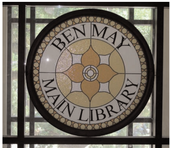
The newly constructed South Entrance features two stories of windows and a beautiful new stained glass logo.

The new addition and renovation plans were designed by Nick Holmes, III. The design will allow Library goers to see where the old building stops, and keeps the transition into the new spaces defined but seamless at the same time. The scale of design is perfect and some additional touches like the decorative fireplace in the Adult Reading Room contribute to the historic feel of the Library. Original materials of the building were salvaged and recycled in other areas of the building too. For example the tile you see on the floor in the