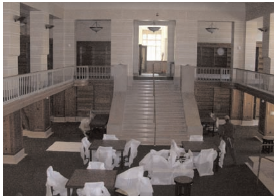
The Katherine C. Cochran/Crampton Trust Reading Room, pictured during the renovation process, has been restored and refurbished. The room will feature new reading tables and chairs, new décor, the original marble steps, and the stunning newly restored chandeliers and bronze torchieres original to the building.

The Reading Room, the room that most people identify with the downtown Library, has been restored thanks to an additional $250,000 donation from the Crampton Trust. The Reading Room has been renamed the Katherine C. Cochran/Crampton Trust Reading Room in honor of this generous gift. The restored Reading Room will still feature the beautiful chandeliers and matching bronze torchieres that lends stateliness to the room. Windows original to the building but long covered with bookcases have been opened up creating cozy reading niches between the shelves. You can now see through the old building into the new expansion area. The most interesting and subtle addition is the faux painting of the columns and walls surrounding the room. The faux painting was done to mimic the scored limestone used in the 1928 construction of the Library and uncov-