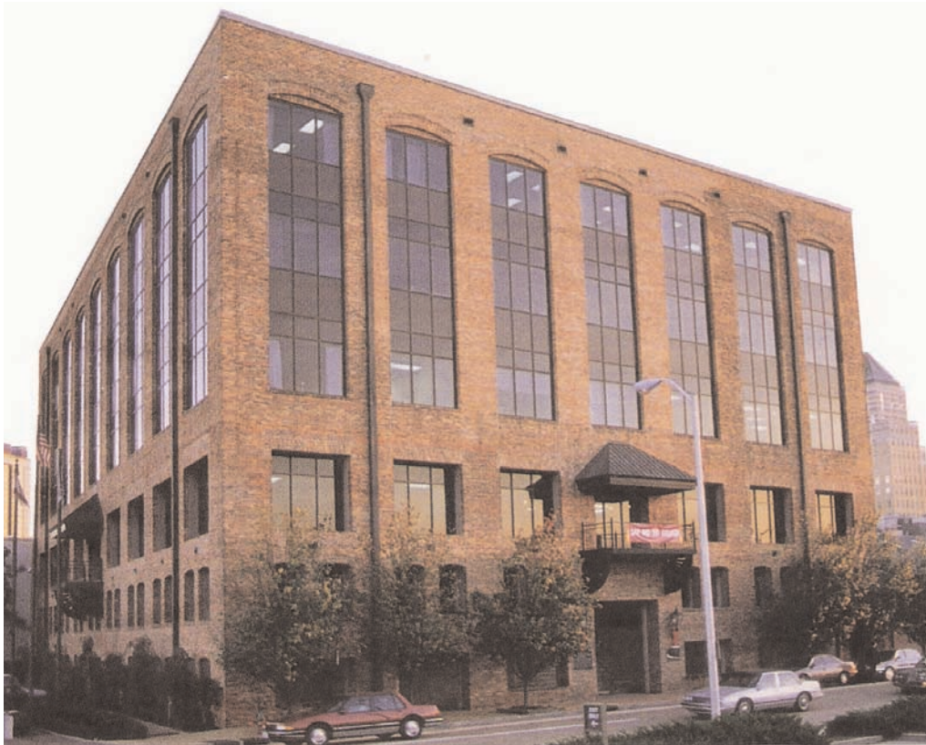
One St. Louis Center celebrates its 100th birthday this year. The building originally known as the McGowin-Lyon Building was a part of the Southern Hardware & Supply.

Each edition of the Downtown Alliance News will feature a different downtown property. The goal of this feature is to provide information to the public on real estate options in the downtown area. If you would like more information on the property featured, please contact the management company or leasing agent directly.