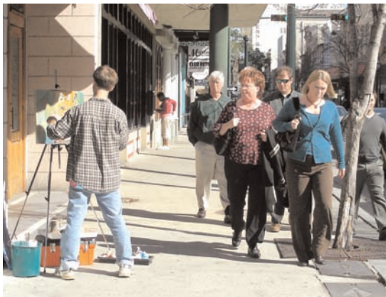
One of Cathedral Square Gallery's 50 regional artists gets inspiration from the sidewalk.

The Gallery is open Monday through Saturday, from 10:00 a.m. until 4:00 p.m. or by appointment.