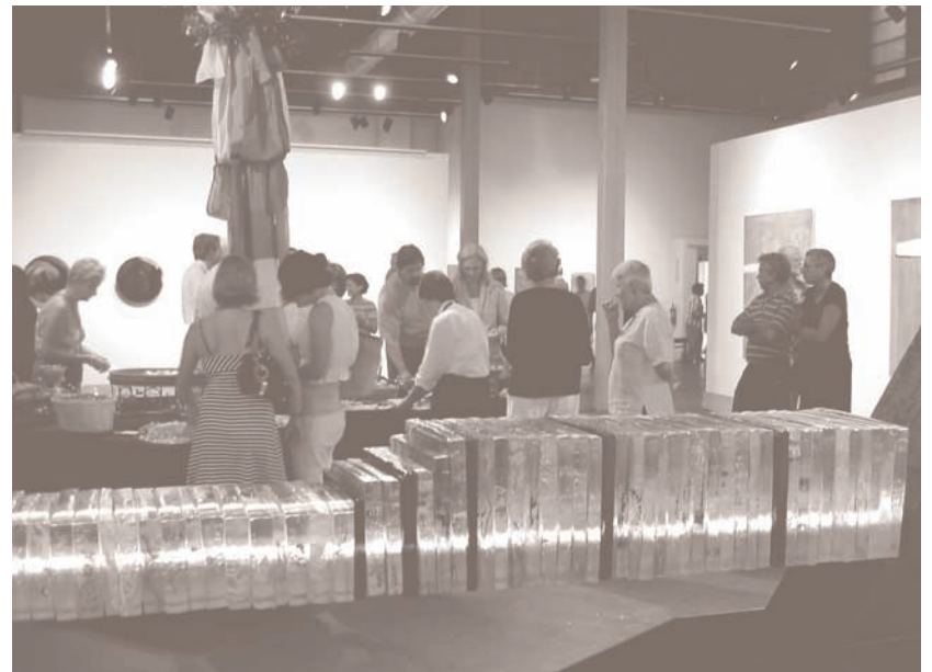
Space 301 opened on the inaugural arts event Arts Alive! in November 2003. Space 301 is Mobile's contemporary art gallery.

In-fill by smaller art galleries began to come and go as downtown grew. A big